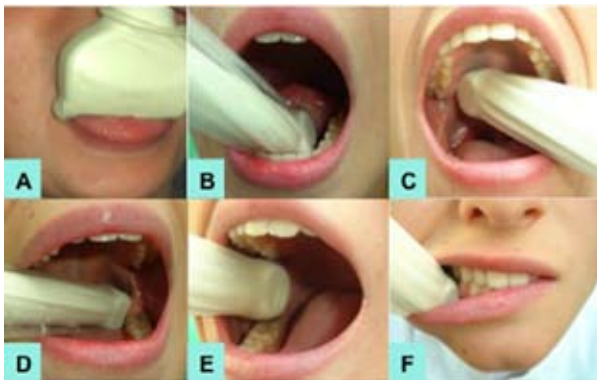
Fig. 2. Intraoral technique used for the assessment of: A- deep lingual a., B- sublingual a., C- greater palatine a., D- inferior alveolar a., E- buccal a., F- mental a.

vessels. Doppler analysis was generated using the standard angle from 0 to 60° adjusted to the blood flow. Doppler sample volume was 1.5 to 3.00. The pulse repetition frequency and the wall filter were regulated to avoid artifacts. Figures 1,2 demonstrate the assessment of arteries Doppler sonography.