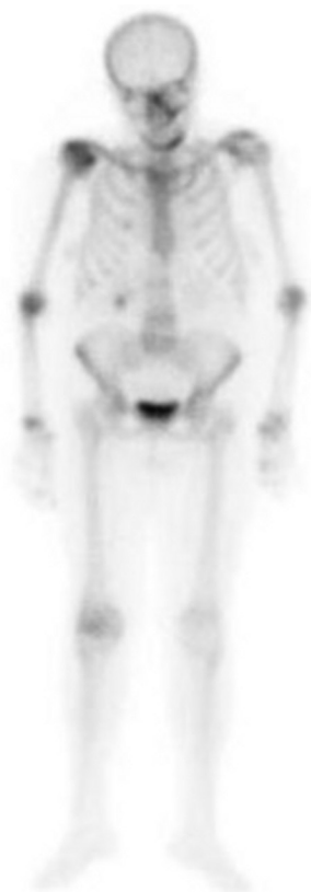
Fig. 1: Bone scintigraphy that shows gadolinium enhancement. Enhancement on the right shoulder corresponds to chronic arthralgia. Enhancement on the left hemimandible is related to subclinical BRONJ.

A bone scintigraphy was performed two years after surgery as a routine control. Interestingly, hypermetabolic focus on right shoulder and left mandible were observed by this test. The increase in contrast uptake on the shoulder area was attributed to a chronic arthralgia. On the other hand, the evaluation of the focus involving left mandible was more difficult (Figs. 1,2). Intraoral examination did not show any significant finding, as well as the orthopantomography. However, an ulceration of the oral mucosa with clinical suppuration and bone exposition was observed three months later. A CT-scan showed radiological findings of BRONJ such as osteosclerosis and bone sequestration (Fig. 3). A biopsy finally confirmed the diagnosis of BRONJ. Patients was treated with surgical curettage of the area, soft tissue remode-