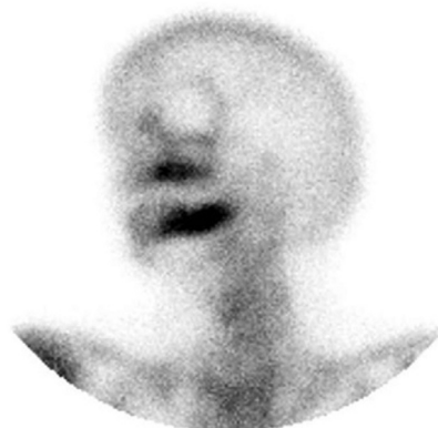
Fig. 2: Pathological enhancement on left hemimandible (detail).