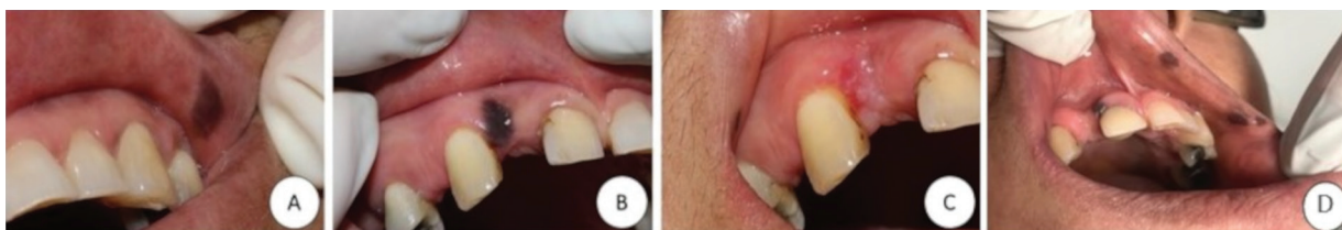
Fig. 1: Clinical aspect of OMA. A) Brownish macula with precise limits localized in the upper lip region on the right side. B) Presence of blackish macula in the maxillary anterior region. C) Brownish macula of smaller size, localized in the upper lip region on the left side. D) Final clinical aspect of OMA after 28 months of follow-up of patient. Three brownish macula localized in the upper lip on the left side, and presence of other blackish macula in the gingiva anterior region.

OMA is a rapid growing lesion occurring mainly in black individuals, and in the majority of cases, in women (2.1:1), with a mean age of 28 years (2,5,6). Thus, differing from the case here related, in which the patient was white. Brooks et al. (7) emphasized that only 10% of cases of OMA were observed in white individuals. In decreasing order, this lesion affects the jugal, labial, palatal and alveolar mucosas. In the present case, gingiva and upper lip were affected, bilaterally. According to Tapia et al. (6), gingiva is outstanding as an atypical site for OMA. According to a previous study by Brooks et al. (7), only 18.9% of the patients with OMA present multiple lesions. Thus, they show evidence of peculiar clinical characteristics of the case here related. In order to review of the literature, it was made a table with a summary of prior reported cases of OMA (Table 1), published until 10th January 2019. With respect to cuta-