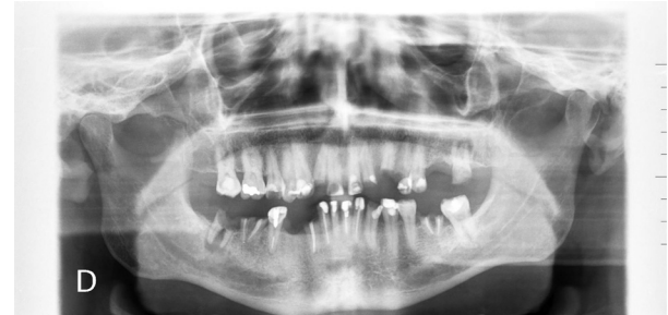
Fig. 3: OPG revealing affection of almost all dental pieces.