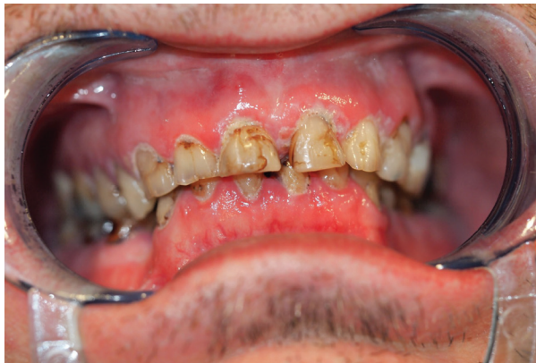
Fig. 2: Multiple caries and dry mouth in physical exploration.