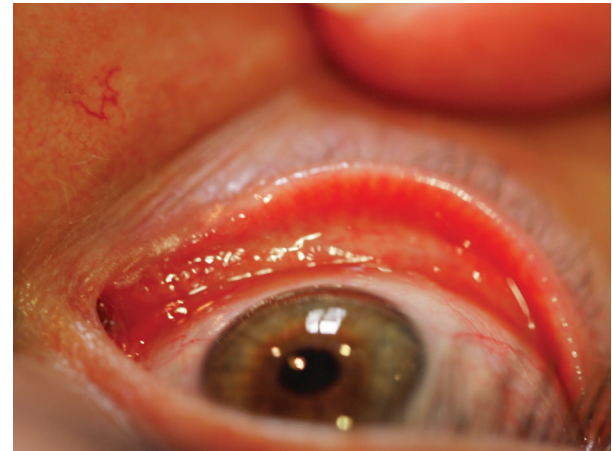
Fig. 4: No tubes or lacrimal puncta are visualized in the ophthalmologic examination.