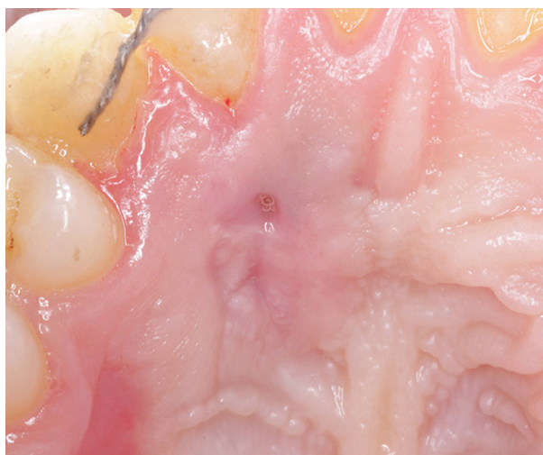
Fig. 3: 3-year evolution of the palatal fenestration.