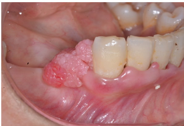
Fig. 1: Intraoral view of the lesion.

34 year old female patient referred to Ondokuz Mayıs University, Faculty of Dentistry, Department of Periodontology with a complaint of a gingival growth at right lower premolar area. Patient reported that she realized the mentioned growth first one month ago and she has no pain or bleeding complaint. With the anamnesis of the patient it has been learned that patient has no systemic disease and no drug use. Patient also reported no use of cigarette and alcohol. At the extraoral examination there was no extraoral finding like swelling or lymphadenopathy. At the intraoral examination it was seen that lower right first premolar, second premolar and first premolar teeth were lost at the mentioned area and a firm and granular surfaced gingival growth which seems like pyogenic granulom/ giant cell granulom with the color of pink and red and having 1.5x1 cm sizes was observed over the edentate alveolar cret where first and second premolar teeth should be (Fig. 1). There was no pain at