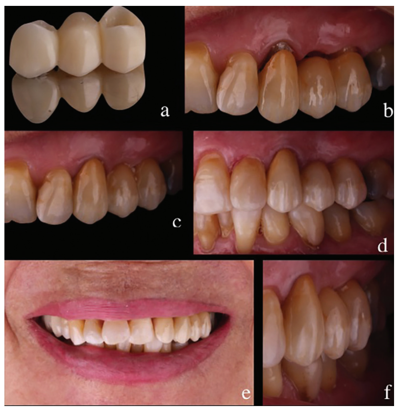
Fig. 2 : A) PolyMethylMethAcrylate (PMMA) test; B) Try-in previous cementation; C) Final restoration; D) 12 months follow-up; E) Smile after 12 months; F) Soft tissue state after 12 months.

Summary of statistics for all three scanners and conventional impression for substrate trueness are presented in Table 1. The mean measurements in terms of trueness in teeth were as follow: STS [0,039 mm], SI [0,054 mm], STD [0,067 mm]; while in soft tissue were as follow: STS [0,051mm], SI [0,09 mm], STD [0,236 mm]. The