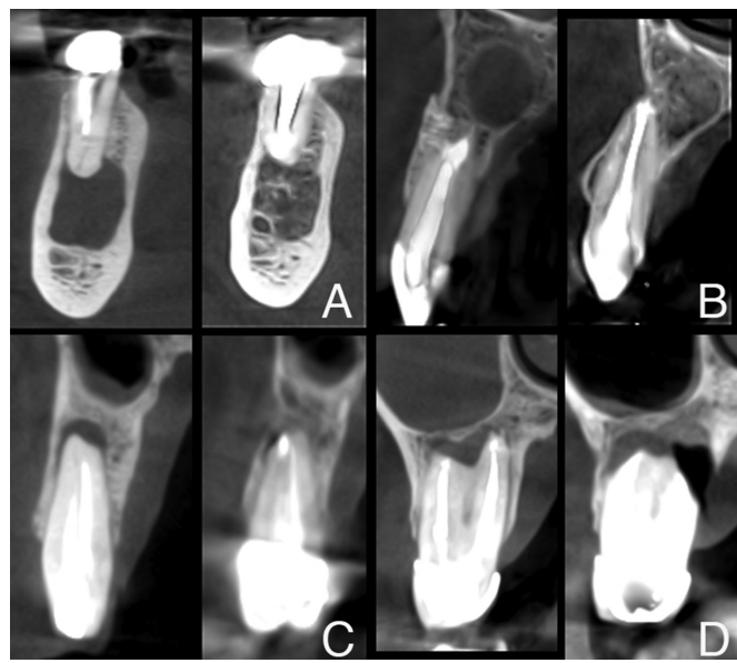
Fig. 4 : Healing of periapical lesions after endodontic microsurgery according to the modified Penn 3D criteria. A) Complete healing. B) Limited healing. C) Uncertain healing. D) Unsatisfactory healing.

ses, if necessary. The best way to establish this is via biopsy, though this approach is not feasible in routine practice; a CBCT study therefore could be a good option. Nevertheless, the healing rate could be underestimated in this case, since the CBCT scan may have been performed some time after healing completion. The healing rate could only be accurately calculated if CBCT scans were made each month, though such a practice would not be justified.