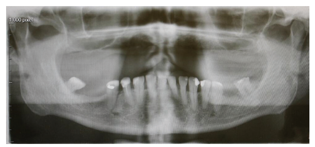
Fig. 1 : A non-smoking 72-year-old man applied to a dentist due to a week-long toothache. The patient had medication for hypertension. Symptoms localized to the completely erupted lower right 3rd molar with local periodontal infection. The patient had body temperature of 38 degrees, but no other symptoms of generalized infection. The tooth was removed by the dentist and the patient received a postoperative antibiotic course.

In the current study, smokers had teeth removal significantly more often at acute state (93%), whereas only 7% were hospitalized for a preceding elective procedure. In addition to known common surgical side effects (26) and local healing in oral cavity (27-29), smoking can alter the oral microbiome (30). Considering our finding, it is possible that smoking is common among patients who visit a dentist for teeth removal at the acute state. In all, smokers are a significant group among severe