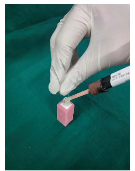
Fig. 2: Kerr Maxcem applied into the Test Specimen.

In this study, tensile strength of 20 resin cement with 10-MDP and 20 without 10-MDP samples, (10 before thermocycling and 10 after thermocycling) were tested. (Table 1).