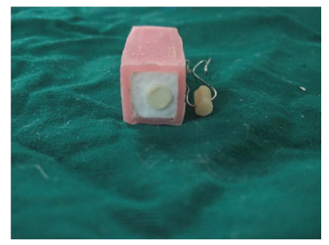
Fig. 4 : Zirconia Surface after Tensile Bond Testing (Adhesive Failure).

The results showed that the difference between the mean tensile bond strength of Zirconia with Panavia 2.0 and Maxcem Elite with and without thermocycling was statistically significant difference. Failure analysis revealed that failures were predominantly adhesive nature in the resin cements (Fig. 4).