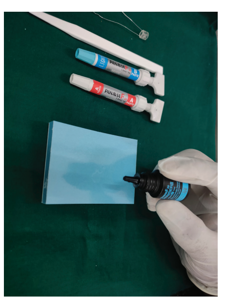
Fig. 1: Primer Application of Panavia 2.0.

For all the test specimens, the interface where fracture occurred was classified as either cohesive or adhesive in nature. The test specimen which fractured at the interface was examined under magnification to determine whether the fracture was adhesive or cohesive. A layer of resin cement present on the Zirconia surface after