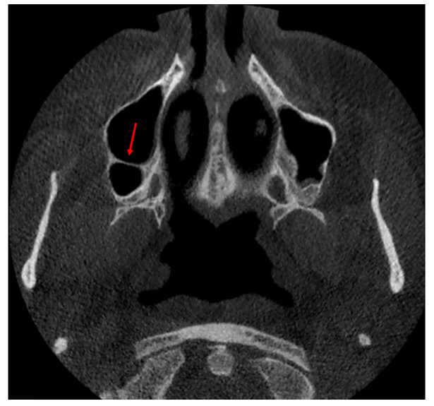
Fig. 1: Axial view of cone-beam computed tomography showing a complete septum in the posterior area of the right maxillary sinus.