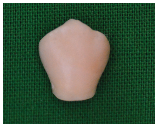
Fig. 1: Tooth Sectioning.

Sixty premolar teeth extracted for orthodontic treatment were collected and the teeth with enamel hypoplasia, caries, and cracks were excluded. The samples were then stored in distilled water. The samples were sectioned as illustrated in Figure 1.