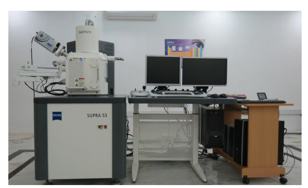
Fig. 3: Field Emission - Scanning Electron Microscope (FE-SEM, SUPRA 55VP).

Evaluation of Surface Morphology and Etching Pattern: 10 sectioned teeth from each group were randomly selected and analyzed with Field Emission - Scanning Electron Microscope (FE-SEM, SUPRA 55VP, Carl Zeiss, Germany) (Fig. 3). The sectioned teeth were fixed onto