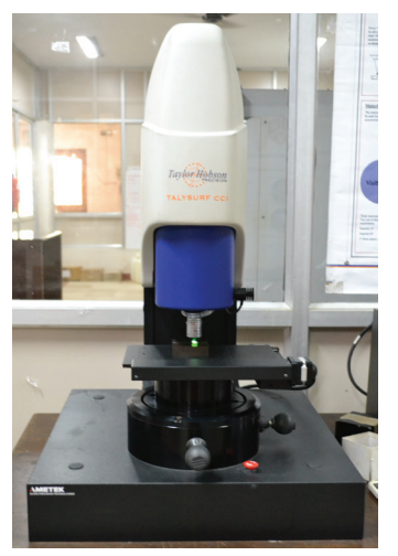
Fig. 2: 3D-Profilometer (THE TALY-SURF CCI LITE).

10 sectioned teeth from each group were randomly selected and analysed with 3D-PROFILOMETER (The Talysurf CCI Lite, Tayler-Hobson Co, England) (Fig. 2) to assess the penetration depth and surface roughness between acid etched and laser etched enamel surfaces.