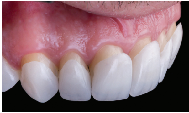
Fig. 1: After removal of provisionals, dry try-in is performed to assess the fitting of laminate veneers, including marginal adaptation and insertion axis of each restoration.

Figures 1 to 3 illustrate the technique, which was carried out using the following clinical steps: