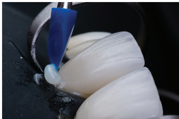
Fig. 3: Removal of restorative composite excesses right after initial seating of the veneer. Excess removal is easy to perform because the preheated composite acquires higher viscosity within seconds after seating.