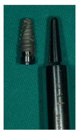
Fig. 2. Osseotite NT Certain Implant (3i Implants Innovations, USA) compared with 4 mm diameter x 13 mm length Osteotome.