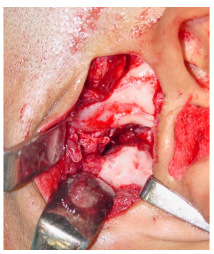
Fig. 3. After the osteotomy, a gap of at least 15mm between the roof of the fossa and the mandible was made