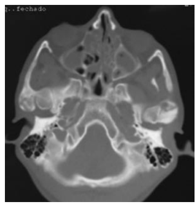
Fig. 1a. Axial CT-scan showing bilateral TMJ ankylosis