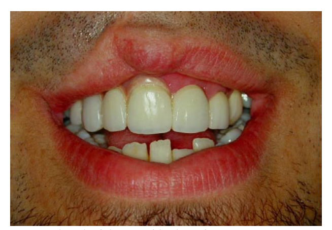
Fig. 3. End result of the case with telescopic crowns.