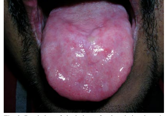
Fig. 3. Remission of the lesion, after intralesional corticosteroid infiltration.