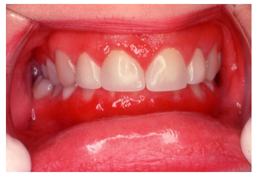
Fig. 1. Irregular erythematous and enlargement were found in the labial gingiva around teeth #8 and 9 (Case 5).

The most common site of clinical signs and symptoms was the gingiva (9 cases, or 75% of the OFG group), followed by the lips (6 cases) and the tongue (6 cases). The clinical symptoms described were erythematous gingiva (8 cases), lip swelling (6 cases), and edematous gingiva (5 cases) (Table 1, Figures 1 and 2). Other characteristic clinical signs described were a granular gingival surface (3 cases, Figure 3), gingival hyperplasia (1 case), and cobblestone enlargement of the buccal mucosa (1 case).