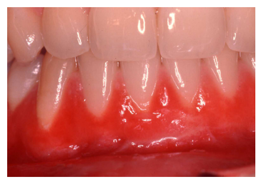
Fig. 2. Edematous swelling was found in the labial gingiva and alveolar mucosa around teeth #24-26 (Case 22).