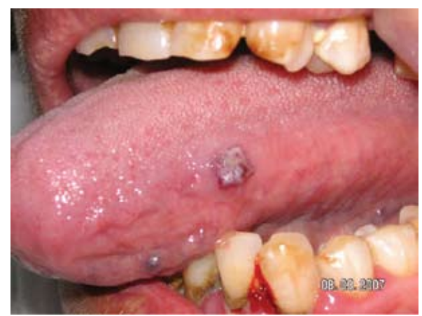
Fig 1. An erythematous papule over the left lateral surface of the tongue.

On dermatologic examination, no angiokeratomas were found anywhere on the skin.