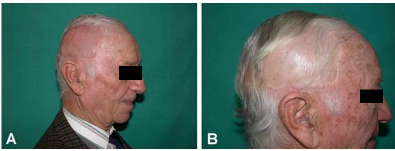
Fig. 2. Postoperative view. A: Four months after oncological surgery; B: Ten months after oncological surgery.

The island graft is a local graft variant composed of a scalp island without pericranium, with a vascular pedicle surrounded by subcutaneous tissue and an aponeurotic layer. It is mobilized to cover scalp defects (3).