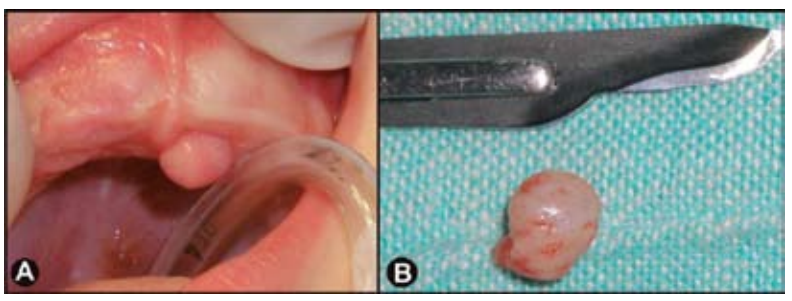
Fig. 1. A. Clinical presentation of the case 1. B. Surgical specimen exhibiting a soft tissue lesion.

- Case 2: A 5-month-old boy was referred for examination of a swelling on the palate. Clinical examination showed a nodule placed lateral and posterior to the incisive papilla, firm on palpation and measuring about 1.2 x 1.0 cm (Figure 3A). His mother reported that the lesion was present since birth and was asymptomatic. Clinical impression was of congenital epulis of the newborn and the baby was periodically followed for five months, until the parents decided to accept an excisional biopsy that was performed under general endotracheal anesthesia. During the surgery it was observed that the nodule was attached to a hard tissue with a dental crown-like morphology. No signs of bone involvement were noted since the nodule and the hard tissue were restricted to soft tissue. The patient's recovery was uneventful and histopathological analysis of the tissue displayed surface