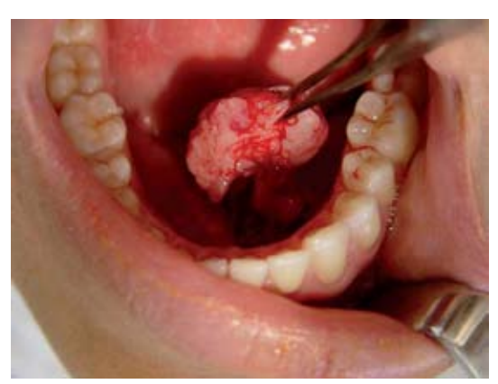
Fig. 3. Trans-operative aspect of the inflammatory myofibroblastic tumor during surgical excision.

eosinophils. The spindle cells exhibited plump tapering vesicular nuclei and were haphazardly arranged (Fig. 2A). Non-cohesive larger stellate or polygonal cells with ovoid vesicular nuclei and prominent nucleoli were scattered. Nuclear atypia and mitosis were not evident.