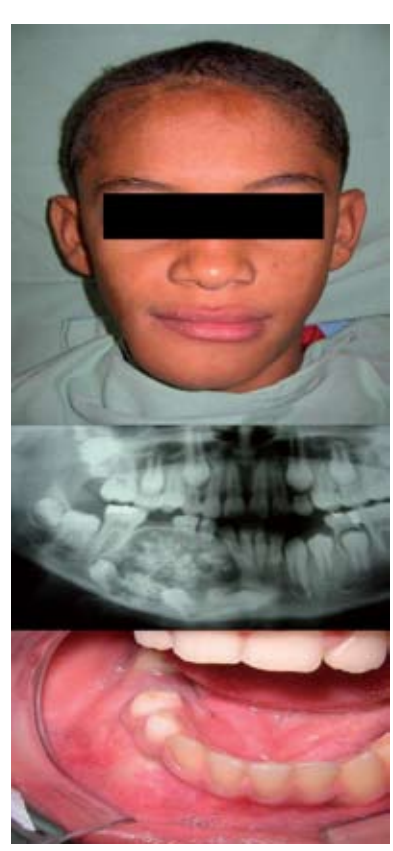
Fig. 1. (Above) Extra-oral examination showing a swelling on the right mandibular body, of hard consistency on the palpation, which caused moderate facial asymmetry. (Middle) Panoramic radiography exhibiting in the right place of mandible a well circumscribed lesion with scattered foci of calcified material which contained several radiopaque bodies of varying sizes and shapes. (Below) Intraoral examination revealing a tumoral mass with great cortical bone expansion, covered by normal mucosa with discrete displacement of neighboring teeth.

able, as were the results of a review of systems and a physical examination. Extra-oral examination showed a painless swelling on the right mandibular body, of firm consistency on the palpation, which caused mode-rate facial asymmetry. Intraoral examination revealed a tumoral mass with great cortical bone expansion, covered by normal mucosa measuring 4.0 x 2.0 cm, located on both the lingual and vestibular faces of the right body of the mandible, with discrete displacement of neighboring teeth. Panoramic radiography exhibited an expansile, radiolucent, well circumscribed lesion with scattered foci of calcified material which contained several radiopaque bodies of varying sizes and shapes. The right lower canine, right lower first premolar and right lower second premolar had been displaced infe-riorly at level of cortical basal of the mandible, whereas that the right lower canine and right lower first molar (both deciduous) showed the roots reabsorbed, and the adjacent permanent incisors displayed their roots displaced in medial position. These findings are illustrated on Figure 1. The provisional diagnoses were odontoma or