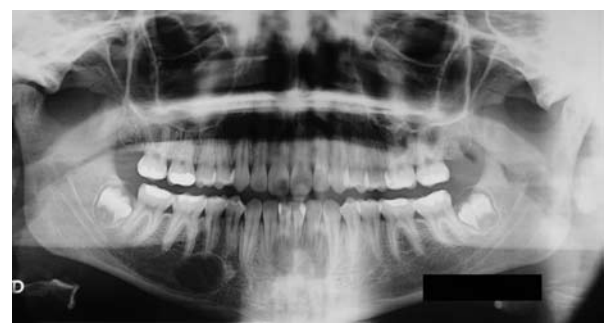
Fig. 1. Panoramic X-ray view. Traumatic bone cyst located in the region of the right lower second premolar.