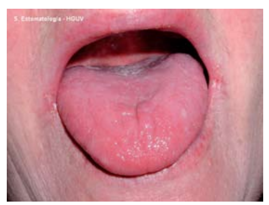
Fig. 1. Chronic erythematous candidiasis on the dorsal surface of the tongue, and bilateral angle cheilitis.