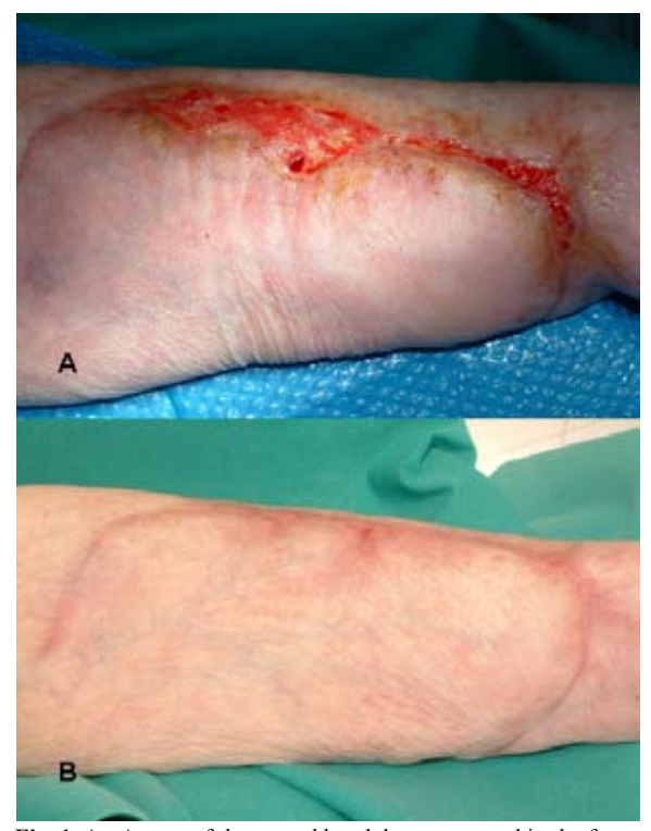
Fig. 1. A.- Aspect of the wound breakdown occurred in the forearm donor site in the early postoperative period. B.- Two weeks after treatment with cultured epithelial autograft. Complete healing with minimum scar contracture and good contour of the forearm is observed.

A 75-year-old white woman was referred for treatment of a recidivant melanoma of the nose. The patient underwent a fasciocutaneous forearm free flap for reconstruction of a left paranasal facial skin defect after excision of the tumor. The forearm defect was closed primarily. In the early postoperative period, wound breakdown occurred in the donor site, with no spontaneous healing (Fig. 1A). In local anesthesia and under sterile conditions a small skin sample (diameter, 6 mm) was taken from behind the ear and the wound was closed with primary suturing. Blood was taken to obtain approximately 50 mL of blood serum. The wound at the donor site behind the ear was managed in the usual manner and the sutures removed after 7 days. After being washed with antibiotic solution, dermis and subcutaneous tissue were removed from the skin sample under aseptic conditions in the cell (Tissue Engineering Research Unit, Oviedo, Spain).