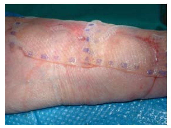
Fig. 3. A cultured epithelial autograft was applied to the radial forearm flap donor defect.