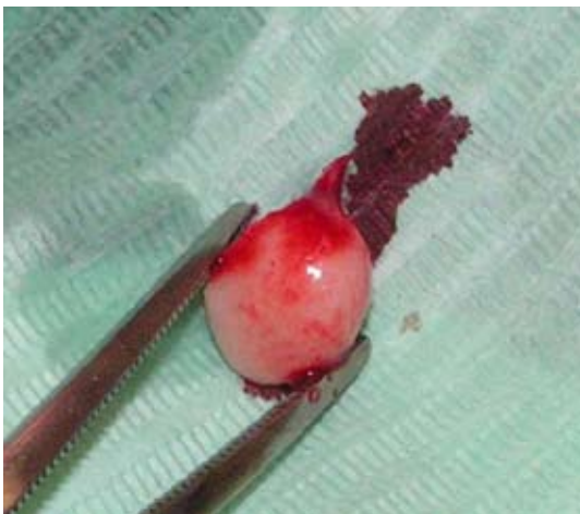
Fig. 3. Mandibular tori as grafts in order to place implants.

among the Saxon population was that of the spindle-shape (39.8%), with the nodular shape not trailing very far behind (37.6%). In the study by Al-Bayaty et al. (4), in the majority of cases 48% (30), the most common shape was flat.