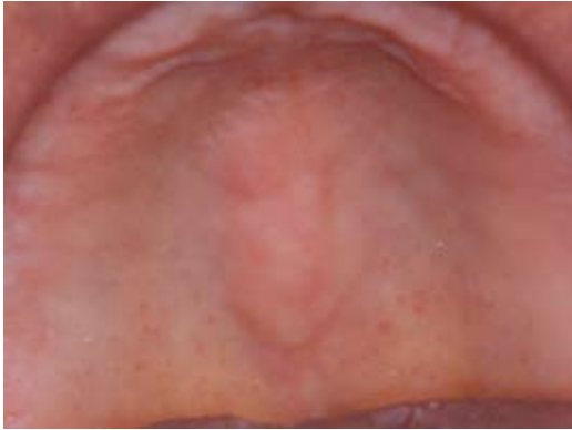
Fig. 1. Palatine tori.