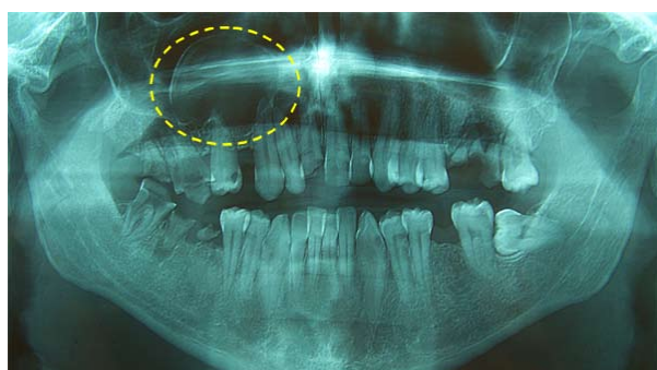
Fig. 2. Residual cyst in the first quadrant, displacing the sinus membrane.