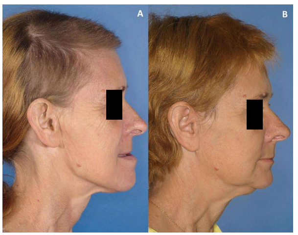
Fig. 1A. Facial appearance on initial presentation: note the false mandibular prognathism and depression on the pre-auricular area. B. 6-month postoperative facial appearance with facial harmony.

Clinical examination revealed a protruded mandible. Depressions on the region anterior to tragus were observed on both sides and condylar palpation was dif-