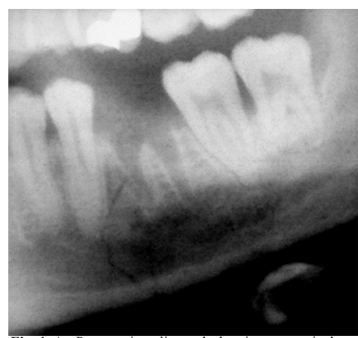
Fig. 1. A.- Panoramic radiograph showing an atypical angular course of the pathological mandibular fracture.

An open reduction, internal fixation by plate osteosynthesis and additional mandibulomaxillary fixation (MMF) were performed under general anaesthesia. On postoperative day 15, MMF was released. Soft diet was prescribed for one month. The patient showed uneventful bone healing following treatment. No signs of osteonecrosis or nonunion were observed after seven months of follow-up.