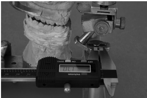
Fig. 2: Measurement of condylar displacement with digital caliper.

For the statistical analysis, the quantitative variables were represented in terms of means, standard deviation (SD), minimum and maximum values; while the qualitative variables were represented in terms of absolute (n) and relative (%) frequencies. The correlation between the measures of interest was assessed with Pearson’s correlation coefficient at a level of significance of \alpha=5\% .