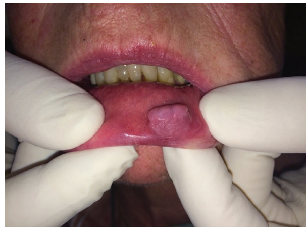
Fig. 1: Exophytic nodule on the lower lip in patient 1.

cine and Oral Pathology, School of Dentistry, National and Kapodistrian University of Athens, Greece for evaluation of an asymptomatic, exophytic nodule located on the lower lip. The patient had first noticed the lesion 4 months ago and since then it has been invariable. Her medical history was unremarkable and the last blood tests were within normal limits. On clinical examination, a well – circumscribed, penduculated, painless soft nodule was noted on the left side of the lower lip (Fig. 1). The lesion was covered by normal mucosa and