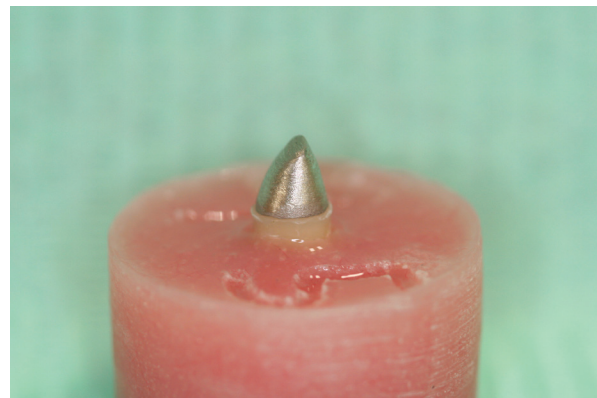
Fig. 1: Experimental cast post and core design in groups B and D.

Following the necessary laboratory procedures (i.e. casting, devesting, cleaning), the cast post and cores were air-abraded with 50-µm aluminum oxide particles under 2.8 kg/cm 2 pressure and steam cleaned. Root canals were irrigated with distilled water and then dried using an air syringe and absorbent paper points. Then, luting was performed using a resin-modified glass ionomer cement (GC Fuji Plus; Tokyo, Japan) after tooth conditioning (GC Fuji Plus conditioner; Tokyo, Japan). The manufacturer's instructions were followed for the luting procedure. Subsequently, 24 hours later, a single stage impression of all restorations was made by using