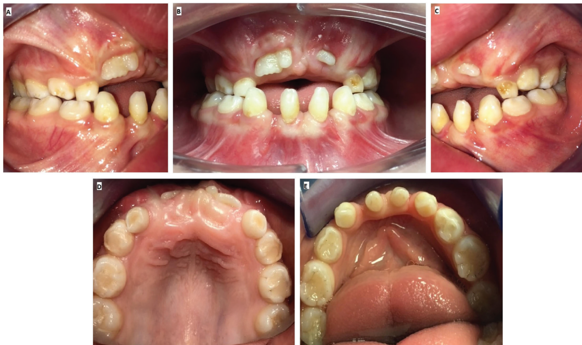
Fig. 2: Intraoral vision A. Right side view, B. Front view, C. Left side view, D. Superior occlusal view, E. Inferior occlusal view.