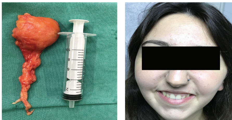
Fig. 3: A) The lipoma of the right side after removal. B) The patient two weeks after surgery.