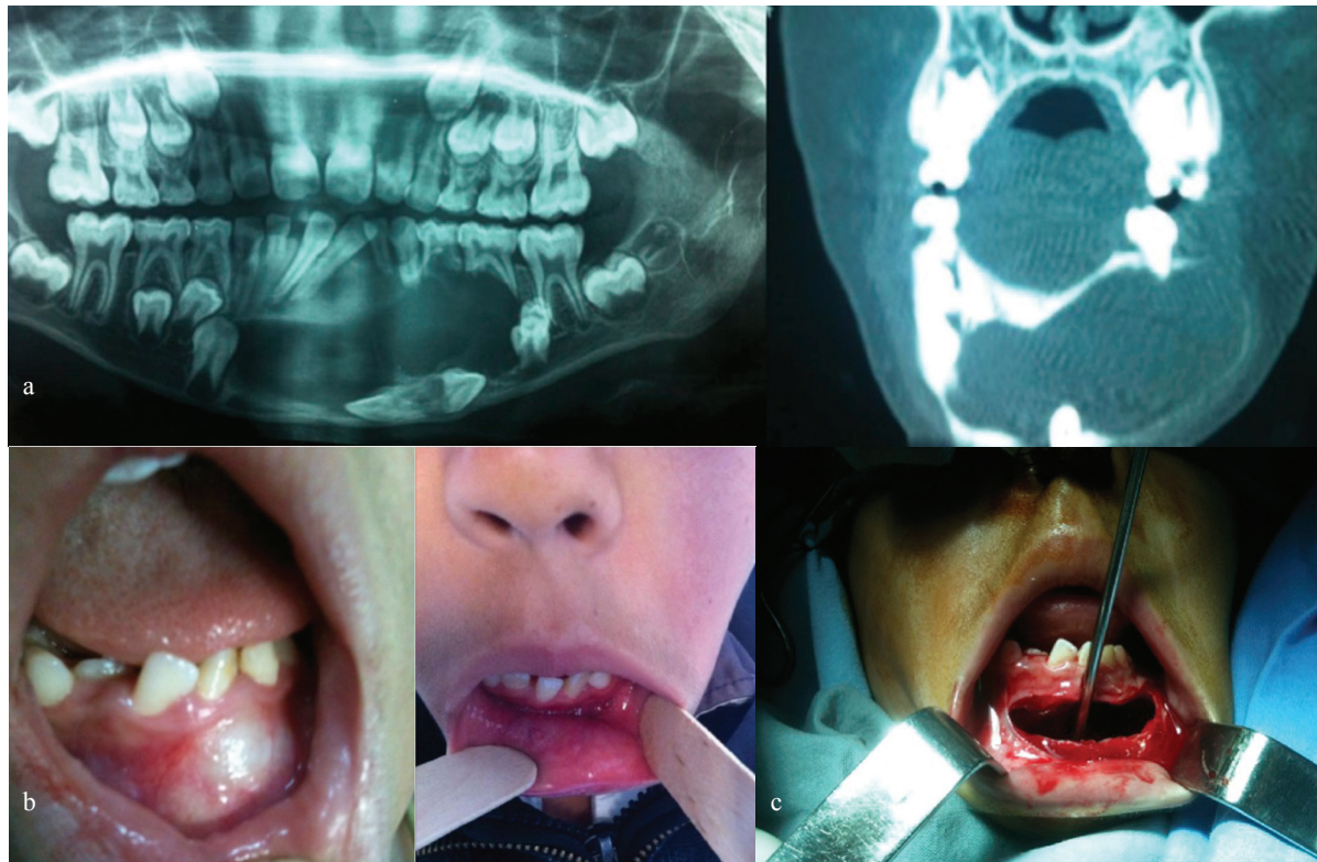
Fig. 1: a- Radiologic data: Orthopantomogram (OPG) and computed tomography scan with giant cyst of the mandible involving an included canine. b: Examination before marsupialization (a), and after 6 months (b). c: Intraoperative view after opening of cystic cavity.