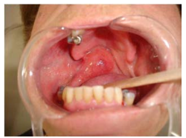
Fig.1. Tumoral erythematous lesion observed in soft palate region.

A 76-year-old-women was referred to the Department of Dentistry of State University of Paraíba, in Brazil, for diagnosis and treatment of a lesion in soft palate. She had noticed the lesion for about 1 year and complaining of lesion that was "growing and difficult to breath". In extra-oral examination was not observed any alterations. In intra-oral examination showed fibrous tumoral lesion in soft palate, of regular surface, erythematous and asymptomatic (Fig. 1). The hypothesis initial clinical diagnosis were mucoepidermoid and adenoid cystic carcinoma. It was requested panoramic radiograph, in which there was no bone involvement. In incisional