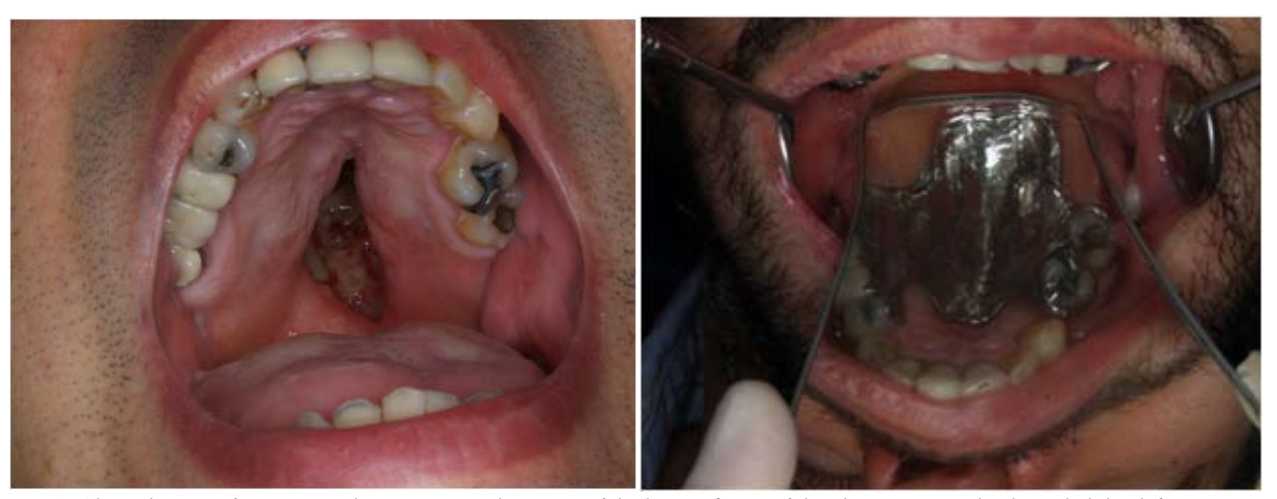
Fig. 2. Clinical views of patient number 4. Despite the extent of the lesion, fitting of the obturator completely sealed the defect.

of recurrent pilonidal abscesses as established from the medical records.