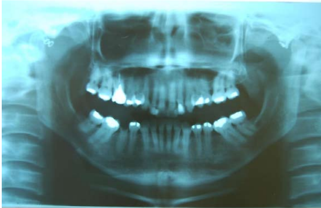
Fig.3. 24 months post-operative panoramic radiography with stable materials at articular eminence.

ning but this maneuver had to be performed under local anesthesia due to patient's anxiety and the difficult to reduce the dislocation. Occlusal splints, restriction of mandibular movements, physiotherapy, and medication were attempted without improvement during 8 months. After failure to solve patients' problem with conservative treatment the surgical procedure to fix bone plates at both articular eminency was proposed to the patient to restrict condyle movements and eliminate CMRD. Under general anesthesia at hospital facilities a pre-auricular incision with an extension to the tempo-ral region