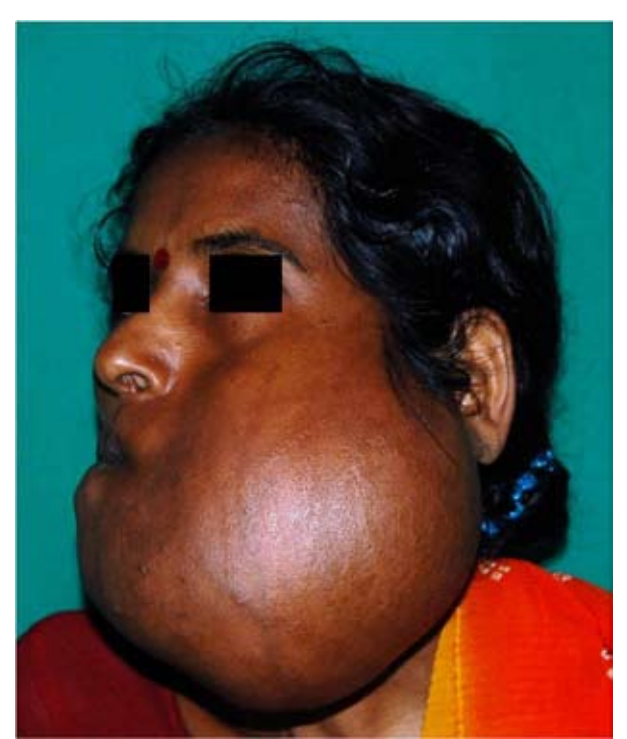
Fig. 1. Preoperative facial appearance (profile view)

On physical examination, patient was moderately built and under nourished. She complained of mild fatigue. Her extremities were slightly edematous. On local examination, a large soft to firm swelling measuring approximately 15 x 10 cm as found in the left cheek, mandible and submental region (Fig.1). Prominent dilated veins were noticed on the surface of the lesion. Skin over the swelling appeared stretched. Intraorally a