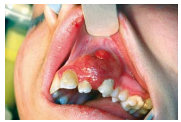
Fig. 2. Appearance of the lesion after conservative treatment with intralesional triamcinolone.

pieces 18, 28, 38 and 48 included and root fragments of pieces 16 and 36, and periapical lesions in relation to pieces 36 and 37. When patient is attended in consultation, a facial, axial and coronal computed tomography (CT)-scan and 3D reconstructions are requested (Fig. 1b), which shows the defect displayed on the Orthopantomography. In Hematoxylin-eosin staining appears intense proliferation of fibroblasts and multinucleated giant cells, and it is reported as "giant cell granuloma." Based on the age of the patient, in the absence of clinical and benign nature of the lesion, we opted for conservative treatment by six cycles of intralesional injection of triamcinolone, with the further implementation of regular radiological controls. However, due to the persistence and escalation of the lesion (Fig. 2), we completed treatment with resection of the granuloma and reconstruction of the defect with microvascular fibula free flap with skin paddle associated by anastomosis of the peroneal vessels to the facial vessels (Fig. 3a). In a second procedure, two months after reconstruction, the flap was defatted (Fig. 3b).