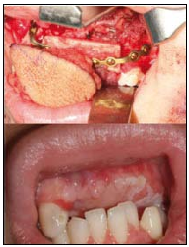
Fig. 3. a Adaptation of microvascular fibula free flap skin paddle associated to the resultant defect after excision. b Appearance of the flap once thinned two months after the reconstructive surgery.

As for handling, typically resorted to surgery, from simple curettage to resection of the lesion. After the surgical treatment has a high rate of recurrence (between 13-49%) (6). Currently calls for a conservative therapeutic, that prevents or diminishes the aesthetic and functional sequelae caused by standard treatments. So basically include three lines of conservative treatment. The most used is the intralesional injection of corticosteroids, with different guidelines and protocols, of which the most widespread in the literature is the weekly injection of triamcinolone (7) associated with local anesthetic for a period six weeks. Other conservative options are the use of calcitonin (8) (usually in the form of nasal spray) or interferon- \alpha (INF- \alpha ) (4,8), both in pattern of several months, depending on the success in reducing the granuloma. Occasionally, due to the high recurrence rate or incomplete disappearance of GCGs with conservative treatment is necessary to supplement the treatment with surgical removal of the same, and if possible, reconstruction of the defect created, for example with buccal fat pad flap (9) or microvascular free flaps, such as the fibula. Whatever the method chosen, it is essential to clinical and radiological control of the patient, through revisions and imaging testing (mainly CT).