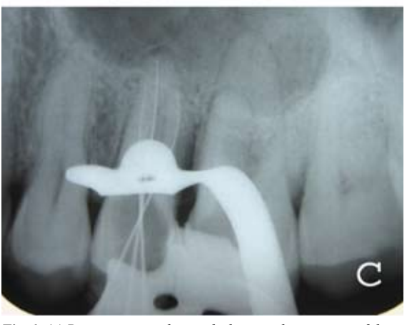
Fig. 1. (a) Preoperative radiograph showing the presence of three separate roots in left maxillary second premolar. (b) The pulpal floor as seen after access opening. The three root canal orifices were located in the same way as in maxillary molar (P-Palatal, MB-Mesiobuccal, DB-Distobuccal). (c) Radiographic confirmation of working length.

to locate all the three root canal orifices. On entry into the pulp chamber, three canal orifices were observed i.e., mesiobuccal, distobuccal and palatal, positioned as in maxillary first molars (Fig. 1). All the three root canal orifices were located using #10 K-file (Dentsply Maillefer, Ballaigues, Switzerland). Working length was established with radiograph by #15 K-files (Fig. 1) and confirmed using an Apex locator (Root ZX, J. Morita