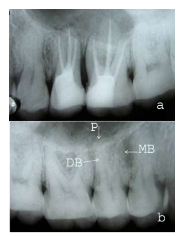
Fig. 2. (a) Post-operative radiograph with all the three canals obturated in second premolar. (b) Radiograph showing the presence of three-rooted maxillary right second premolar in the same patient (arrows pointing; P-Palatal, MB-Mesiobuccal, DB-Distobuccal).

Inc). The canals were cleaned and shaped with hand Kfiles and nickel titanium rotary files (Protapers, Dentsply Maillefer, Switzerland) frequently irrigating with 5% sodium hypochlorite and 17% EDTA. Calcium hydroxide was used as an intracanal medicament and the access cavity was sealed with Cavit (ESPE, Seefeld, Germany). Cleaning and shaping was also performed in tooth 26 using K-files and nickel titanium rotary files (Protapers, Dentsply Maillefer, Switzerland) followed by placement of calcium hydroxide intracanal medicament. The access cavity in first molar was sealed with Cavit (ESPE, Seefeld, Germany). In the next appointment, one week later, the patient was asymptomatic. Intracanal calcium hydroxide dressing was removed from tooth #25 and the canals were irrigated with 5% sodium hypochlorite. Canals were dried with sterile paper points and obturated with gutta-percha and AH Plus sealer (Dentsply DeTrey GmbH, Germany) by cold lateral condensation technique. Access cavity was restored with composite resin. Tooth #26 was subsequently obturated with gutta-percha and AH Plus sealer (Dentsply DeTrey GmbH, Germany) using cold lateral condensation technique and restored with composite resin. Radiograph was taken to confirm the quality of the obturation (Fig. 2). Periapical radiograph was also taken in relation to right maxillary premolars in the same patient which revealed the presence three separate roots in tooth #15 (Fig. 2).