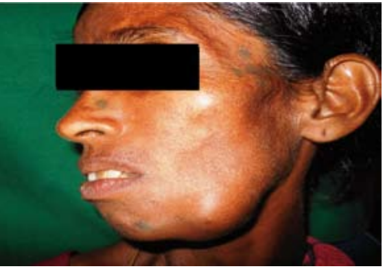
Fig. 1. Extra oral picture showing swelling on left side of the mandible.

Intraoral examination revealed a diffuse swelling in the