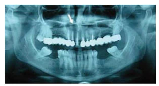
Fig. 3. Panoramic radiograph. Postoperative control at 12 months.

The lesion was removed, with periapical surgery of the affected teeth (#6, #7 and #8) under local anesthesia and conscious sedation. Surgical specimen measured 1 x 1 cm. The patient is currently under periodic clinical and radiological controls in order to detect any possible relapse (Fig. 3).