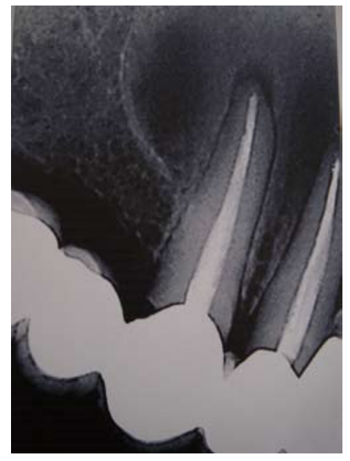
Fig. 1. Periapical X-ray view. Radiotransparency in the anterior zone of the right upper maxilla, enveloping teeth #6, #7 and #8.

A 55-year-old Caucasian woman was attended in the Service of Maxillofacial Surgery for evaluation and treatment of a right upper maxillary lesion affecting canine, lateral and central incisors (teeth #6, #7 and #8). Local clinical examination and on the rest of the orofacial structures was unremarkable. The radiographic study (Fig. 1) showed a circular radiotransparency with scle-