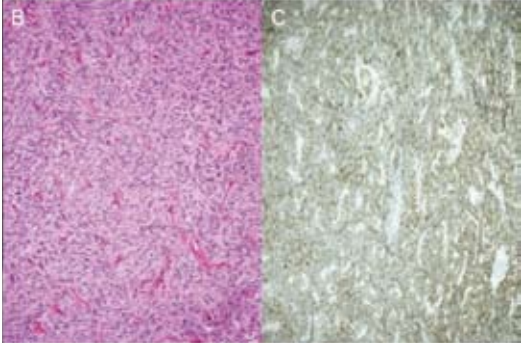
Fig. 1. A. Contrast-enhanced T2-weighted magnetic resonance image. Note a well-defined tumor in the right parotid gland. It shows high signal intensity with homogeneous enhancement; B. Tumor cells arranged in a storiform pattern. C. They show reactivity with bcl-2.

Two years later, the patient suffered a recurrence. She developed a mass measuring 6 cm localized under the masseter muscle. During the excision of the tumor, destruction of the adjacent mandibular cortical bone was observed. The margin of the tumoral resection in this location was microscopically positive.