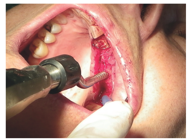
Fig. 3. Cortical fracture performed with an osteotome.