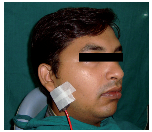
Fig. 2. Patient positioned with surface electrode pads.