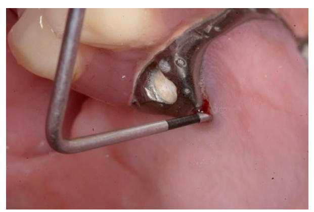
Fig. 1. Oroantral communication in relation to zygomatic implants (ZIs) in a severely resorbed maxilla, after 3 years of prosthetic loading. Detail of probing depth verifying the permanent bilateral OAC before ZIs extraction.

Amoxicillin 500 mg/125 clavulanic acid, 3 times during 10 days, and Ibuprofen (600 mg, 3 times daily) were prescribed for the treatment of sinusitis and pain. Patient