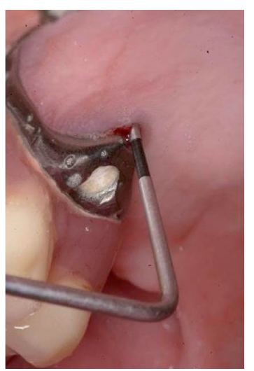
Fig. 1. Detail of probing depth of the failed transzygomatic implant showing oroantral communication.

surgeon (MPD). After COA occurrence, buccal fat pad technique was selected in order to its seal. To expose the buccal fat pad, in all cases a trapezoidal mucoperiosteal flap was raised extending on each side of the defect and to the bottom of the vestibule. A 1-cm vertical incision was made in the reflected periosteum, posterior to the zygomatic buttress. A blunt clamp was introduced towards the temporomandibular angle to separate the fibers of the buccinator muscle, and a light pressure was exerted on the cheek to prolapse the buccal extension of Bichat's ball. The necessary amount of buccal fat was pedicled to cover the defect entirely (Figs. 1-3). Once placed on the defect, the fat pad was covered as much as possible with the mucoperiosteal flap because due to its fragile and lobulated structure the buccal fat pad alone may not always provide adequate sealing. The mucoperiosteal flap was sutured without tension.