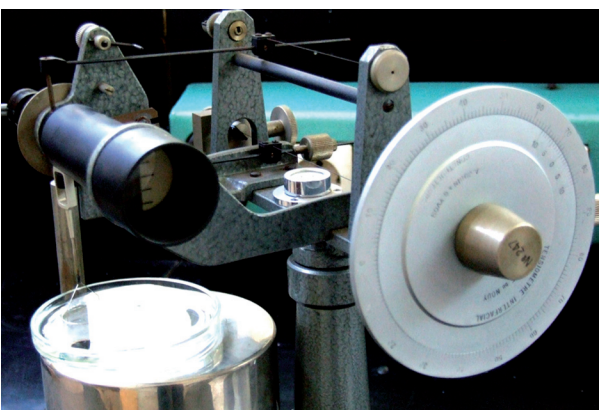
Fig. 1. Du Nuoy ring tensiometer for interfacial surface tension measurement.

Tween 80 was combined with 70% Ethanol co-surfactant (INTERNATIONAL COMPANY for sup. and med. industries, Giza, Egypt) in a ratio of 1:1 as adjuvant co surfactant enhancing the hydrophilicity of the surfactant mixture (17). A pilot study was conducted to determine the Tween 80 critical micellar concentration producing the lowest surface tension and contact angle values for every irrigant. The range of implemented values was between 0.1 till 1.5 ml by volume from the main solution. Interfacial surface tension was measured using the Du Nuoy ring tensiometer, (CSC Scientific company inc, VA, USA), (Fig. 1) (18). The functionality of this tensiometer was based on the gradual insertion of a platinum iridium ring in the fluid to be tested, then its gradual withdrawal till the formed fluid lamella in the ring gets detached.